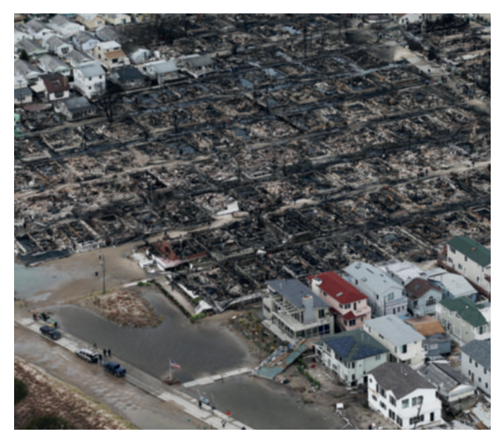
Devastation wrought by Hurricane Sandy in 2012

Another problem is the tendency to focus resilience strategies on preventing disasters that have already occurred, instead of a broader approach to defend against a multitude of disasters that could occur. This is the mistake planners are trying to avoid in the wake of Hurricane Sandy. Here, "[t]he business response [is] largely a continuation of existing practices based on a historical picture of past risks, and often fails to adequately consider changing climate and weather conditions."