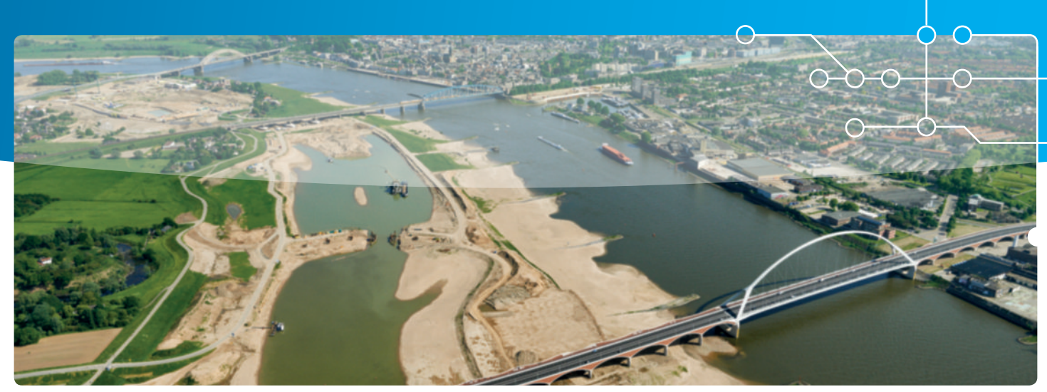
HSD Issue Brief 5/2014