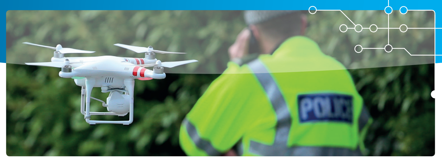
HSD Issue Brief 4/2014