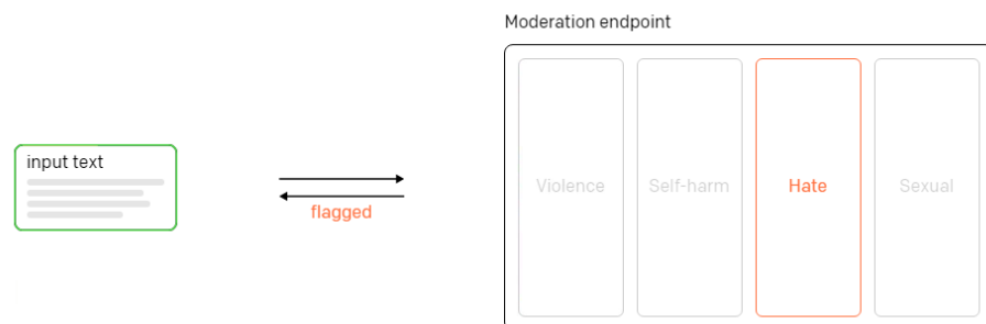
Figure 1: ChatGPT’s content moderation system 7 .

Given the significant wealth of information to which ChatGPT has access, and the relative ease with which it can produce a wide variety of answers in response to a user prompt, OpenAI has included a number of safety features with a view to preventing malicious use of the model by its users. The Moderation endpoint assesses a given text input on the potential of its content being sexual, hateful, violent, or promoting self-harm, and restricts ChatGPT’s capability to respond to these types of prompts 6 .