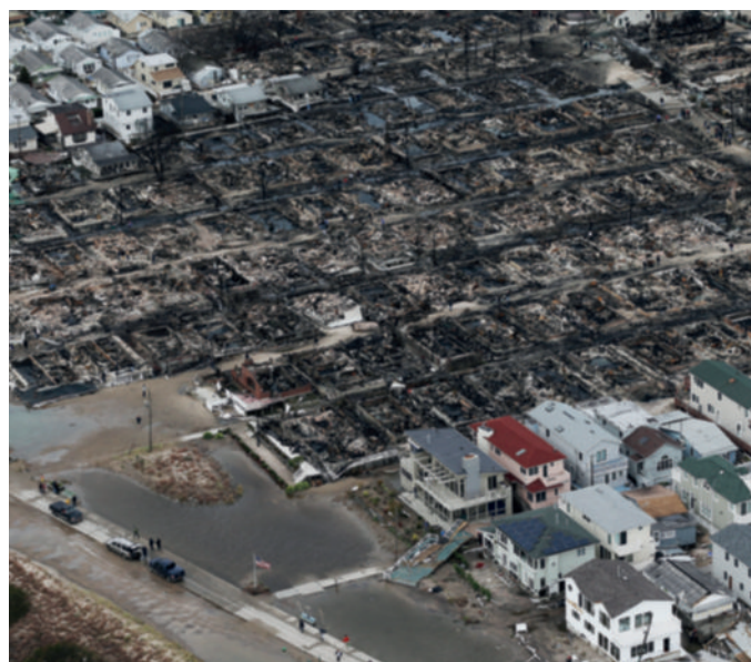
Devastation wrought by Hurricane Sandy in 2012

Another problem is the tendency to focus resilience strategies on preventing disasters that have already occurred, instead of a broader approach to defend against a multitude of disasters that could occur. This is the mistake planners are trying to avoid in the wake of Hurricane Sandy. 10 Here, '[t]he business response [is] largely a continuation of existing practices based on a historical picture of past risks, and often fails to adequately consider changing climate and weather conditions.' 11